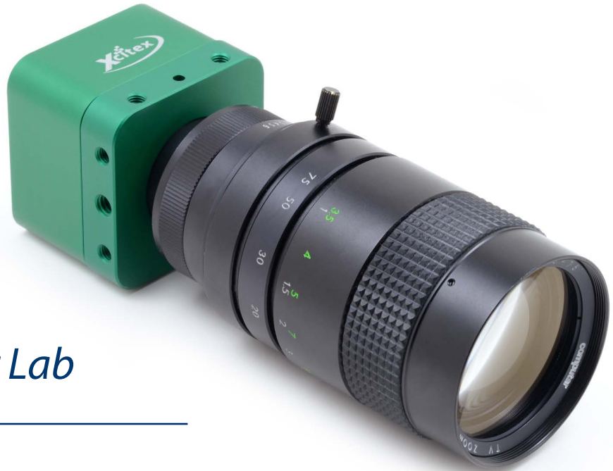
Lens sold separately

Small and Rugged – Easy Setup in Field or Lab